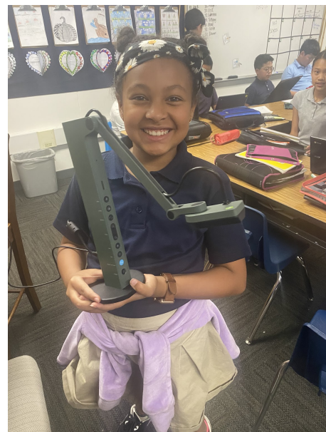
Kids love the Ipevo!