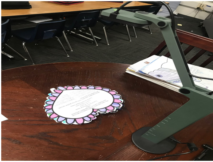
Recording a math Valentine's Day lesson.