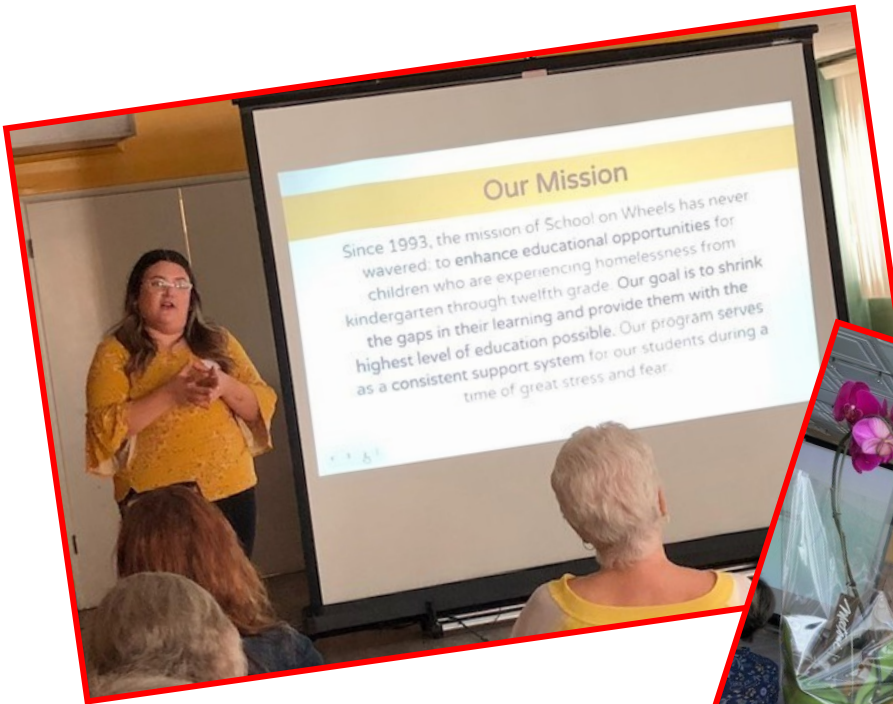
School on Wheels