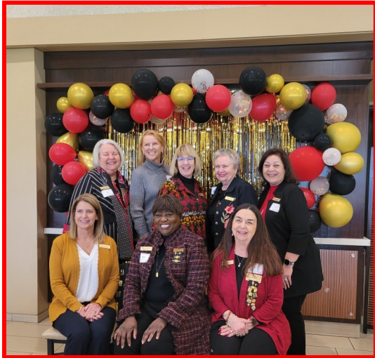
DKC California Officers and Committee Members in attendance