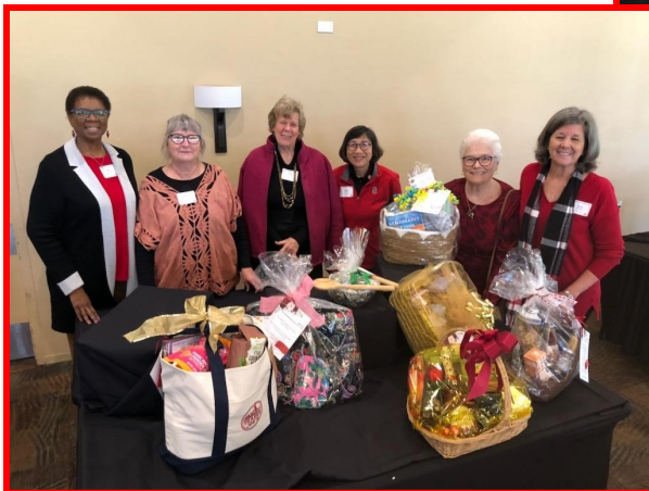
And the winners are...!!