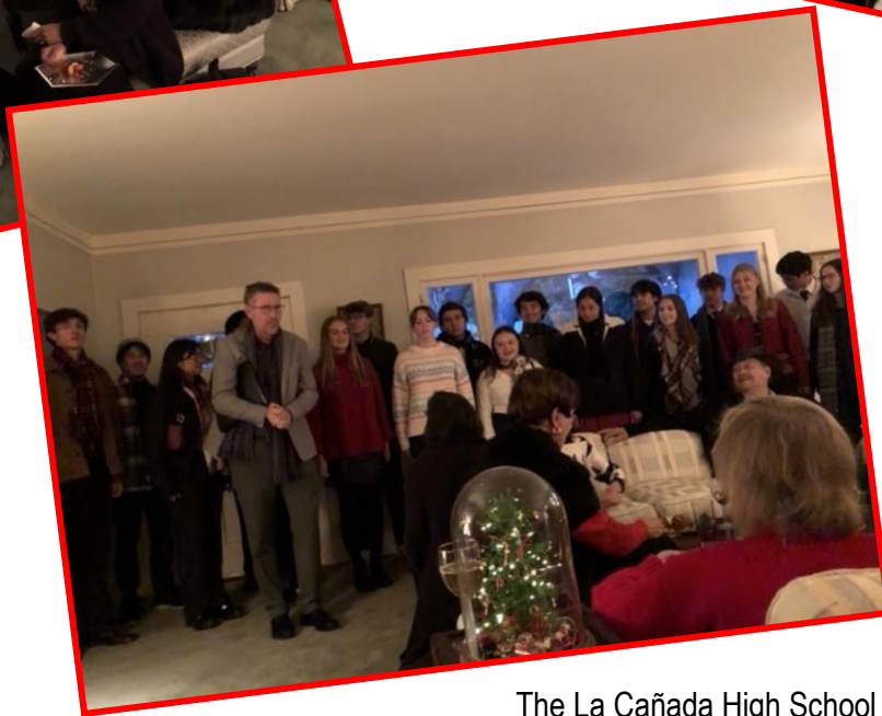
The La Cañada High School Chamber Singers Provided a special holiday touch to the afternoon!