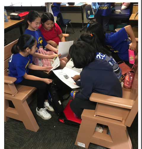
Face to face discussions.