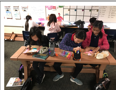
Lightweight and easy to move!

I am extremely grateful to the BNEF for this opportunity to provide our students with the opportunity to grow and collaborate together with these multi-functional benches. These benches perfectly exemplify Arcadia Unified's core value that states, "We're better together." Thank you!