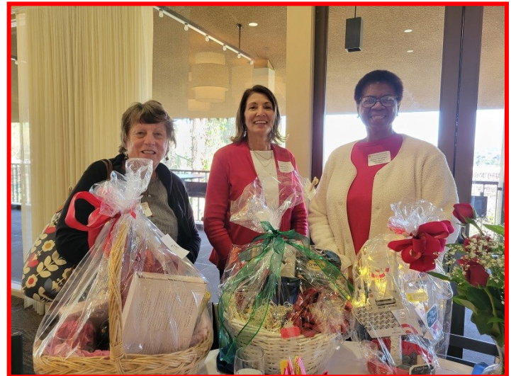
...And the winners are!!!!!!