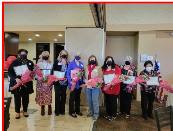
Area XIII Honorees