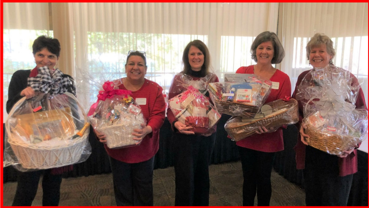
And the winners are—!