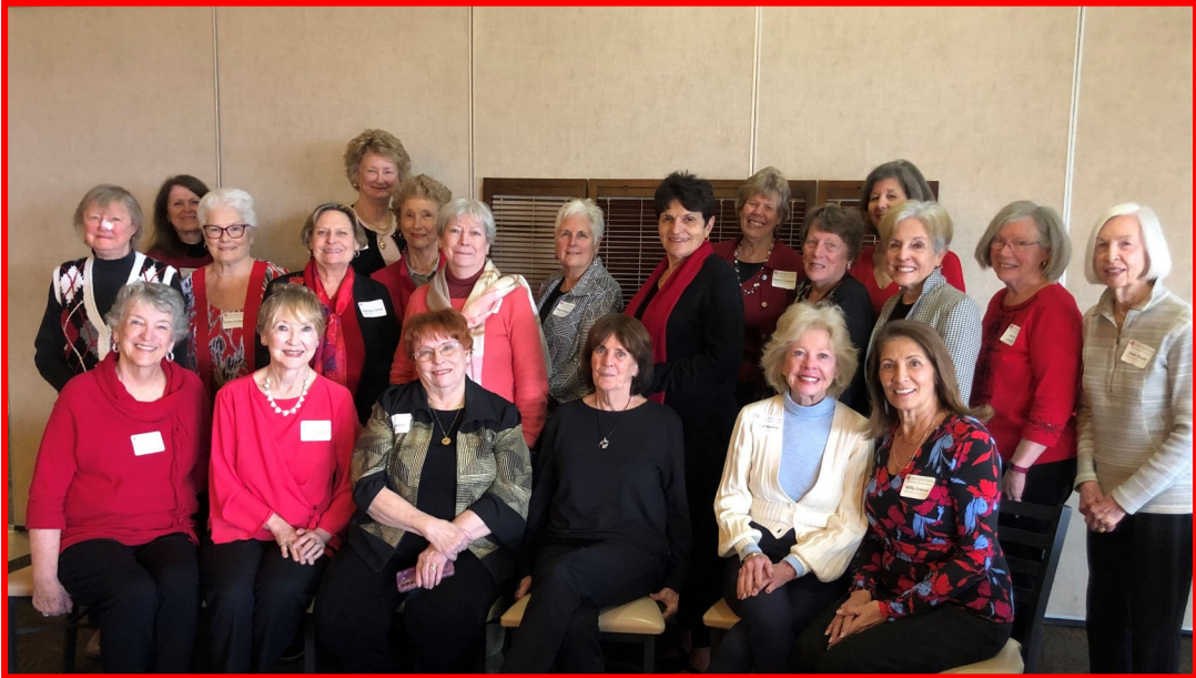
Alpha Upsilon was well represented at the Area XIII Conference on February 4, 2023!!