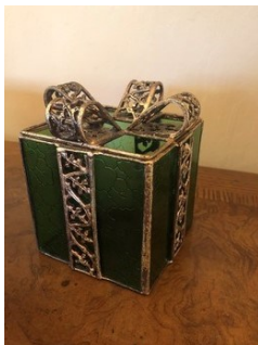
Stained glass gift box; candles can be inserted inside for a lovely holiday glow in your home!

The LIFE Foundation Board of Directors has been working hard and are now presenting an online Silent Auction in place of the annual raffle! You are urged to visit the Silent Auction site and see what is available. There are numerous interesting items. Why not do your holiday shopping with the LIFE Foundation?! Some sample items include—