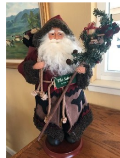
Everyone can use another Santa!