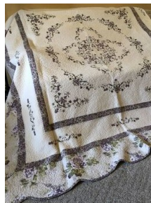
Lovely lavender peony quilt!