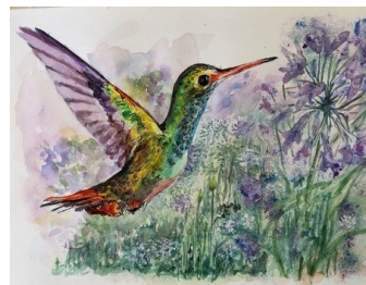
One of many original prints and or paintings available!